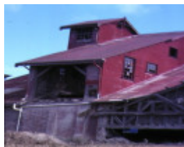
former standard brickworks federation street box hill red corrugated iron building