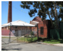
FORMER STANDARD BRICKWORKS SOHE 2008