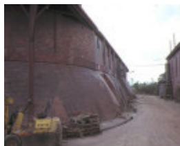
former standard brickworks federation street box hill side view kiln dec1987