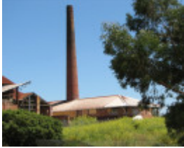
FORMER STANDARD BRICKWORKS SOHE 2008