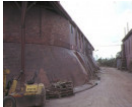
former standard brickworks federation street box hill side view kiln dec1987