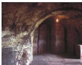
former standard brickworks federation street box hill vault dec1987