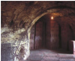
former standard brickworks federation street box hill vault dec1987