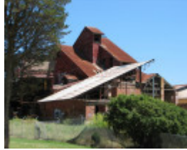
FORMER STANDARD BRICKWORKS SOHE 2008