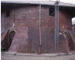
former standard brickworks federation street box hill end view kiln dec1987