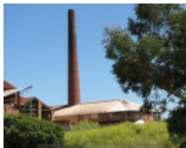
FORMER STANDARD BRICKWORKS SOHE 2008