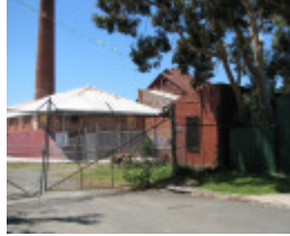
FORMER STANDARD BRICKWORKS SOHE 2008