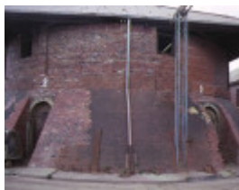
former standard brickworks federation street box hill end view kiln dec1987