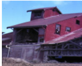
former standard brickworks federation street box hill red corrugated iron building