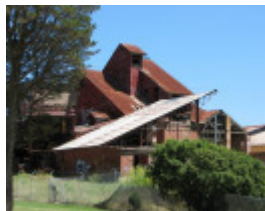
FORMER STANDARD BRICKWORKS SOHE 2008