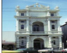
1 former colonial bank bendigo front view dec1993