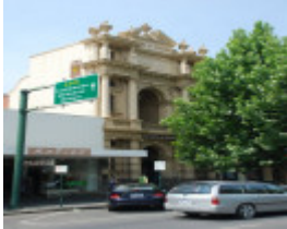
NATIONAL AUSTRALIA BANK SOHE 2008