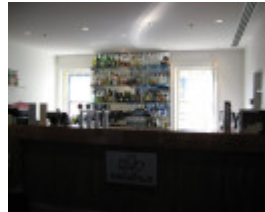
Oddfellows Hotel_Oct 2010_KJ