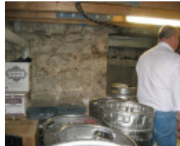
Oddfellows Hotel_Oct 2010_KJ_cellar