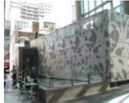
Oddfellows Hotel_Oct 2010_KJ_rear