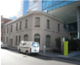
Oddfellows Hotel_Oct 2010_KJ