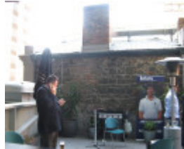
Oddfellows Hotel_Oct 2010_KJ_rear terrace