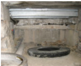
Oddfellows Hotel_Oct 2010_KJ_cellar_opening to Little Lonsdale now sealed