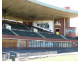
GLENFERRIE OVAL GRANDSTAND SOHE 2008