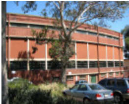
GLENFERRIE OVAL GRANDSTAND SOHE 2008