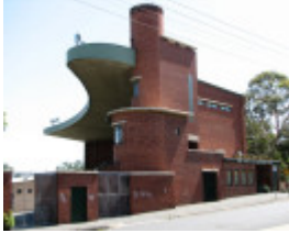
GLENFERRIE OVAL GRANDSTAND SOHE 2008