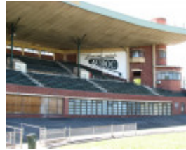
GLENFERRIE OVAL GRANDSTAND SOHE 2008