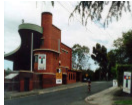
1 glenferrie oval grandstand linda crescent hawthorn side view