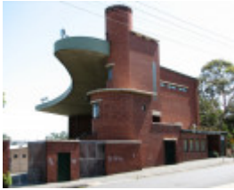
GLENFERRIE OVAL GRANDSTAND SOHE 2008