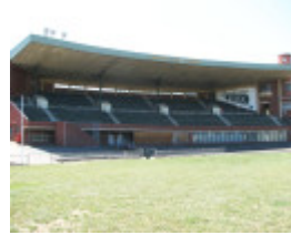
GLENFERRIE OVAL GRANDSTAND SOHE 2008