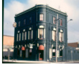
Golden Age Hotel Geelong Front