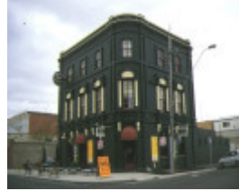
1 golden age hotel geelong front view apr1997