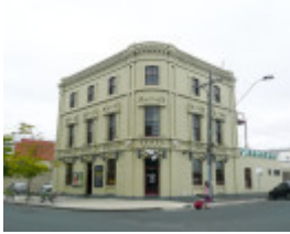
GOLDEN AGE HOTEL SOHE 2008