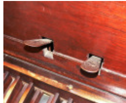
Pedals, Biggs Pipe Organ, Cavendish