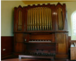
Biggs Pipe Organ, Cavendish