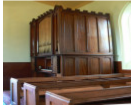
Biggs Pipe Organ, Cavendish 2