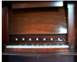
Manual, Biggs Pipe Organ, Cavendish