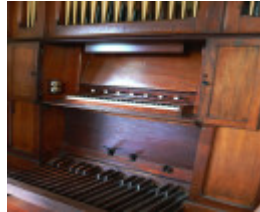
Console and pedals of the Biggs Pipe Organ, Cavendish