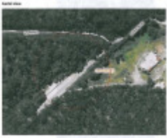
Former Crossroad Station