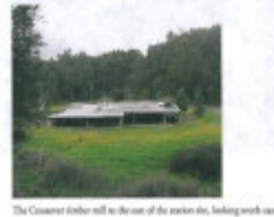
The Crossover timber mill to the east of the station site, looking west east.