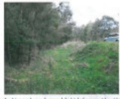
Looking north-east along track bed (platforms to either side)