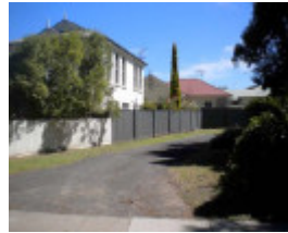
Former William Rutledge & Co. Properties