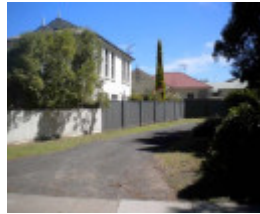
Former William Rutledge & Co. Properties