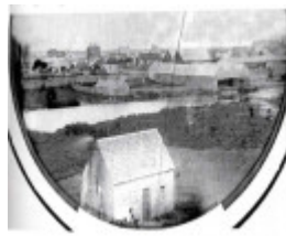
Former William Rutledge & Co. Properties