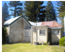
Former William Rutledge & Co. Properties