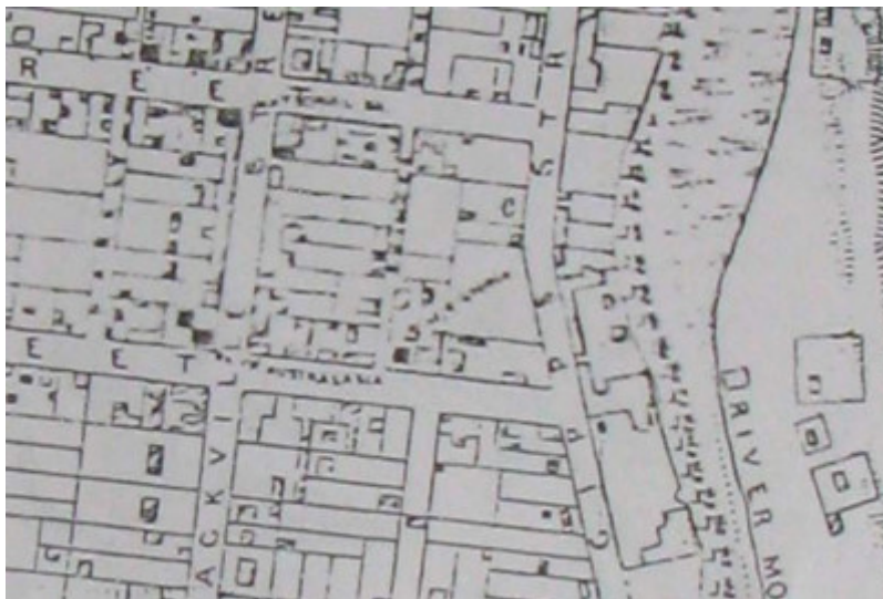
Former William Rutledge & Co. Properties