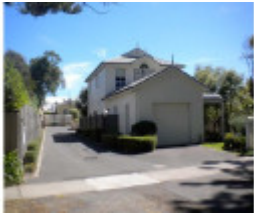
Former William Rutledge & Co. Properties