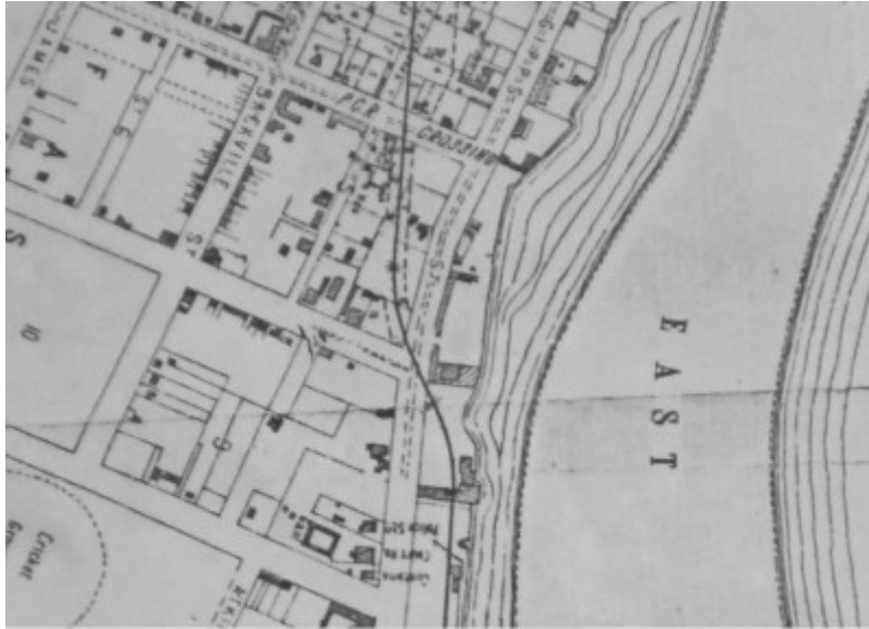
Former William Rutledge & Co. Properties