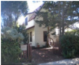
Former William Rutledge & Co. Properties