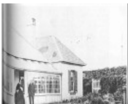
Former William Rutledge & Co. Properties