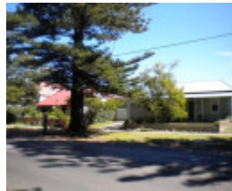
Former William Rutledge & Co. Properties