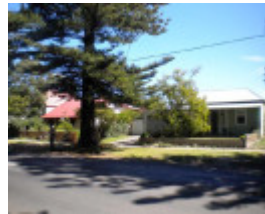
Former William Rutledge & Co. Properties