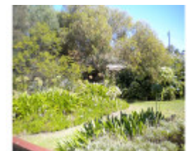
Former William Rutledge and Co Properties