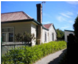
Former William Rutledge & Co. Properties