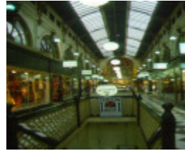
1 royal arcade melbourne interior sw oct1999