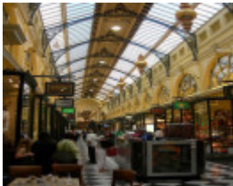
ROYAL ARCADE SOHE 2008