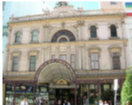
ROYAL ARCADE SOHE 2008