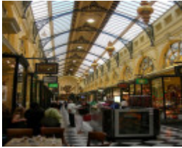
ROYAL ARCADE SOHE 2008