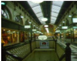
1 royal arcade melbourne interior sw oct1999