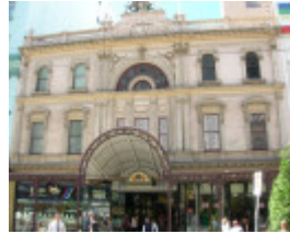
ROYAL ARCADE SOHE 2008