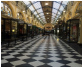
ROYAL ARCADE July 2016