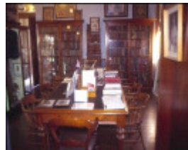
chiltern anthenaeum and museum conness st chiltern interior 2003