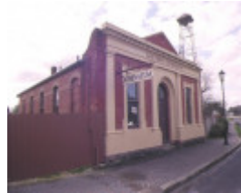
1 athenaeum library & town hall conness street chiltern front view