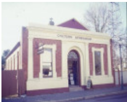
chiltern anthenaeum and museum conness st chiltern front from south west she project 2003