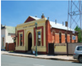
CHILTERN ATHENAEUM AND MUSEUM SOHE 2008