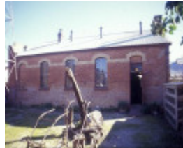
chiltern anthenaeum and museum conness st chiltern east elevation 2003