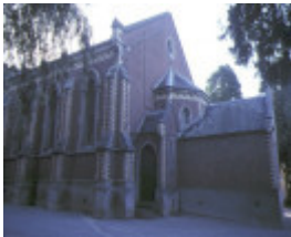
former congregational church brighton rear of church nov1984