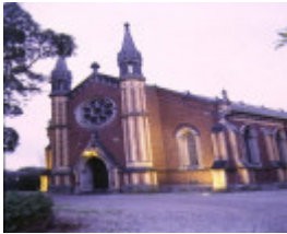
1 former congregational church brighton front view