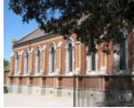
FORMER CONGREGATIONAL CHURCH SOHE 2008