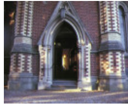
former congregational church brighton detail of front entrance