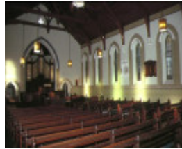
former congregational church brighton interior fron view