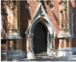
FORMER CONGREGATIONAL CHURCH SOHE 2008