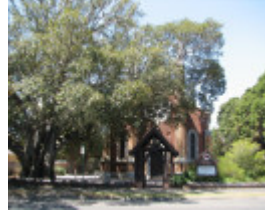
FORMER CONGREGATIONAL CHURCH SOHE 2008