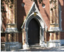
FORMER CONGREGATIONAL CHURCH SOHE 2008