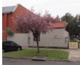
H0954 DOLLS HOUSE LHA 2015 1.JPG