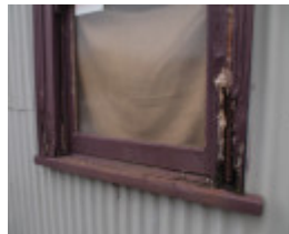
H0954 DOLLS HOUSE LHA 2015 4.JPG