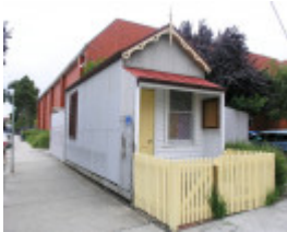
DOLLS HOUSE SOHE 2008