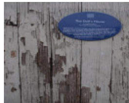
H0954 DOLLS HOUSE LHA 2015 3.JPG