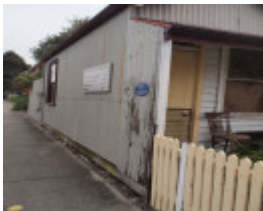
H0954 DOLLS HOUSE LHA 2015 2.JPG