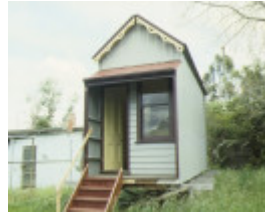
1 dolls house collingwood front view