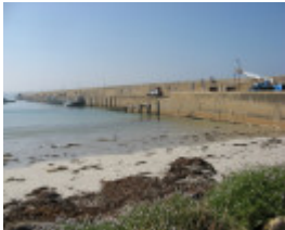
Warrnambool Concrete breakwater_KJ_May 09