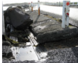
Warrnambool viaduct now_2009