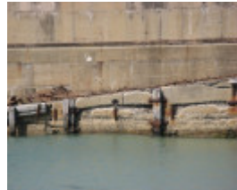
Warrnambool breakwater_ mass concrete_KJ_May 09