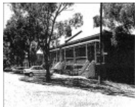
Fernville Terrace, 35-41 Mackenzie Street, 1885-; demonstrating the influence of the steep terrain on house design in this part of Bendigo where sub-basements become full height on the downhill side of a site.