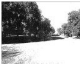
The leafy path of Barkly Street, as it crosses Barkly Terrace