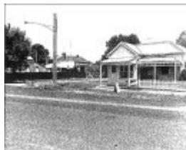
Precinct 6.04 - corner of Milroy and Stevenson, precinct 6.4: corner store and adjacent timber houses of the late 19th early 20th centuries.