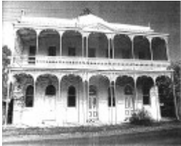
Long Gully Ironbark Comm Res Precinct 5 Gold Mines Hotel.jpg