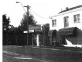
Long Gully Ironbark Comm Res Precinct 5.1 Ironbark Township.jpg