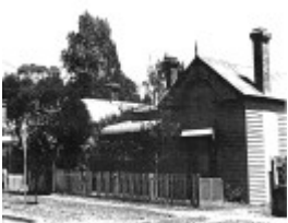
Former Golden Square Precinct 10 - House at 28 Panton Street.jpg