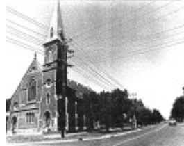
Former Golden Square Precinct 10 - Panton Street Church.jpg