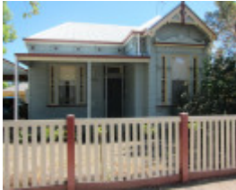
247 Napier Street