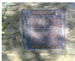
Coranderrk Cemetery. Site Visit - M.Miller 4/10/13