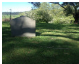
Coranderrk Cemetery. Site Visit - M.Miller 4/10/13