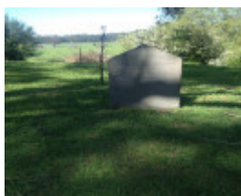
Coranderrk Cemetery. Site Visit - M.Miller 4/10/13