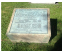
Coranderrk Cemetery. Site Visit - M.Miller 4/10/13