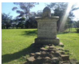
Coranderrk Cemetery. Site Visit - M.Miller 4/10/13