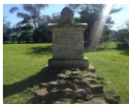
Coranderrk Cemetery. Site Visit - M.Miller 4/10/13