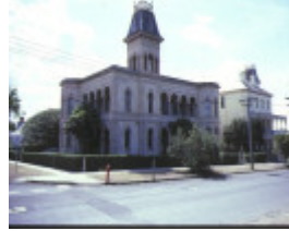
1 lathamstowe gellibrand street queenscliff front view