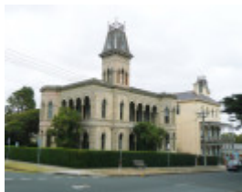
LATHAMSTOWE SOHE 2008