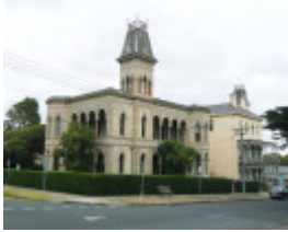
LATHAMSTOWE SOHE 2008