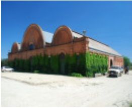
FAIRFIELD SOHE 2008