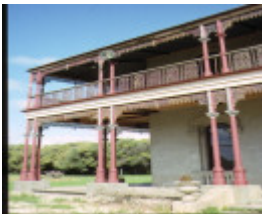
fairfield murray hwy browns plains verandah of homestead sep1990