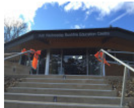
After Photograph - Reference F3896 2016