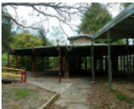
Before Photograph - Reference F3896 2014