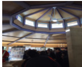
After Photograph - Reference F3896 2016