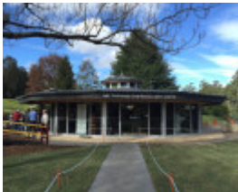
After Photograph - Reference F3896 2016