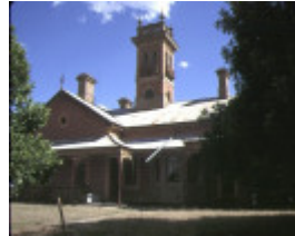
1 olive hills murray valley hwy browns plains front view dec1987