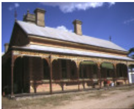
olive hills murray valley hwy browns plains rear view dec1987