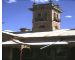
olive hills murray valley hwy browns plains detail of tower dec1987