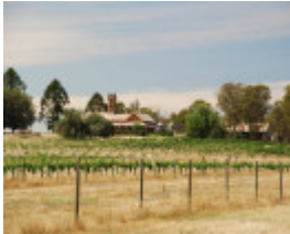
OLIVE HILLS SOHE 2008