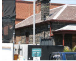
COTTAGE SOHE 2008