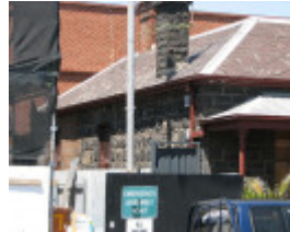
COTTAGE SOHE 2008