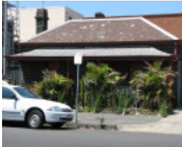
COTTAGE SOHE 2008