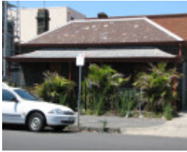
COTTAGE SOHE 2008