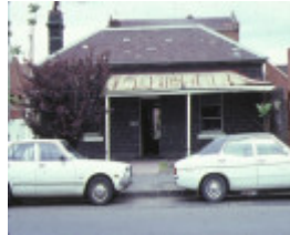
1 cottage barkly street brunswick front view oct1984