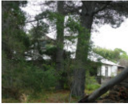
BALLARA SOHE 2008