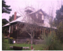
1 ballara glaneuse road point lonsdale rear elevation jun1995