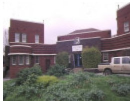
1 camberwell court house & police station front view