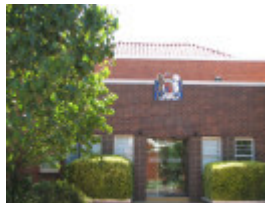
CAMBERWELL COURT HOUSE AND POLICE STATION SOHE 2008