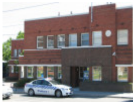
CAMBERWELL COURT HOUSE AND POLICE STATION SOHE 2008