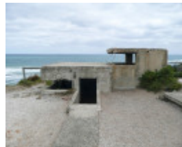
POINT LONSDALE LIGHTHOUSE SOHE 2008