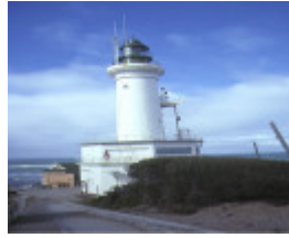
1 point lonsdale lighthouse point lonsdale front view aug1984