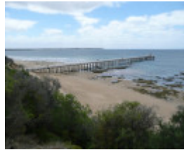
POINT LONSDALE LIGHTHOUSE SOHE 2008