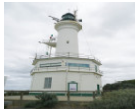
POINT LONSDALE LIGHTHOUSE SOHE 2008