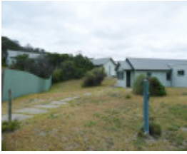
POINT LONSDALE LIGHTHOUSE SOHE 2008