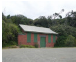
POINT LONSDALE LIGHTHOUSE SOHE 2008