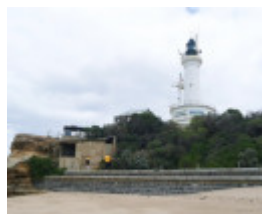
POINT LONSDALE LIGHTHOUSE SOHE 2008