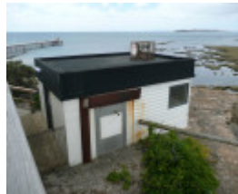
POINT LONSDALE LIGHTHOUSE SOHE 2008