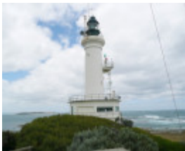
POINT LONSDALE LIGHTHOUSE SOHE 2008