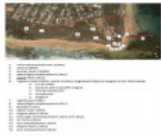
buildings and features.JPG