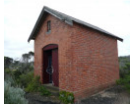
POINT LONSDALE LIGHTHOUSE SOHE 2008