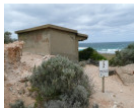
POINT LONSDALE LIGHTHOUSE SOHE 2008