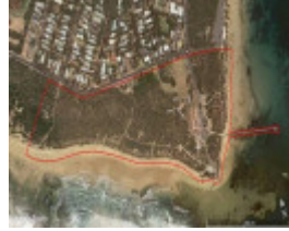
aerial view extent of registration.jpg