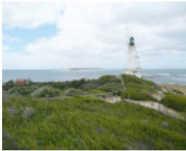
POINT LONSDALE LIGHTHOUSE SOHE 2008