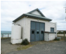
POINT LONSDALE LIGHTHOUSE SOHE 2008