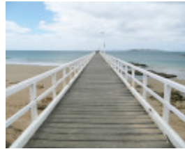
POINT LONSDALE LIGHTHOUSE SOHE 2008