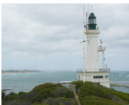
POINT LONSDALE LIGHTHOUSE SOHE 2008