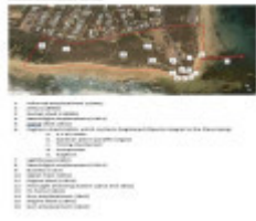
buildings and features.JPG