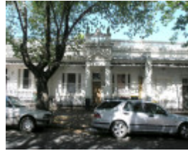
NATHAN'S TERRACE SOHE 2008