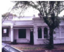
h01205 nathans terrace 10 wellington street facade she project 2004