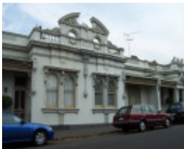
H01205 nathan s terrace 7 shield street flemington exterior1 feb2003