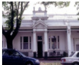
h01205 nathans terrace 6 wellington street facade she project 2004