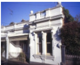
h01205 nathans terrace wellington and shields street flemington front of 11 shields st she project 2003