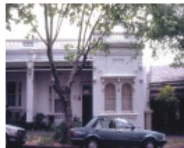
h01205 nathans terrace 4 wellington street facade she project 2004