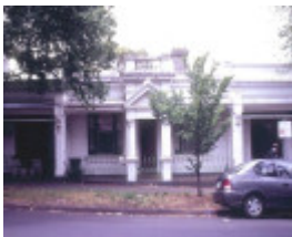
h01205 nathans terrace 12 wellington street facade she project 2004