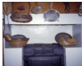
h01205 nathans terrace wellington and shields street flemington original stove of 11 shields st she project 2003