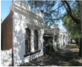
NATHAN'S TERRACE SOHE 2008