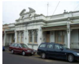
H01205 nathan s terrace 7 shield street flemington exterior2 feb2003