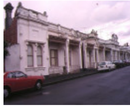
1 nathan's terrace wellington street flemington front view apr1996