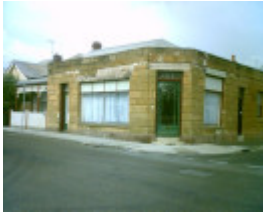
71 Elizabeth Street, Geelong West