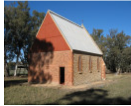
St Peters Carapooee_rear view_KJ_29 May 08