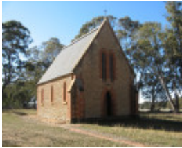
St Peters Carapooee_KJ_29 May 08