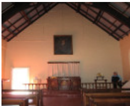
St Peters Carapooee_interior_KJ_29 may 08