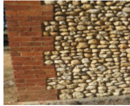
St Peters Carapooee_detail_KJ_29 may 08