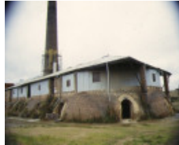
former hoffman brickworks dawson street brunswick front view