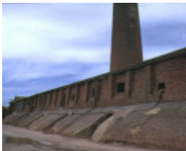
former hoffman brickworks dawson street brunswick side view & chimney