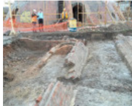
Excavation 15-18 Aug 11, 1.jpg