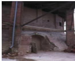
former hoffman brickworks dawson street brunswick storage entrance