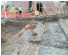
Excavation 15-18 Aug 11, 1.jpg