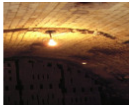
former hoffman brickworks dawson street brunswick vaulted cellar