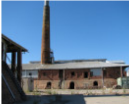
FORMER HOFFMAN BRICKWORKS SOHE 2008