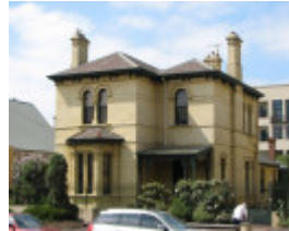
CHRIST CHURCH SOHE 2008