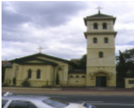
christ church brunswick tower