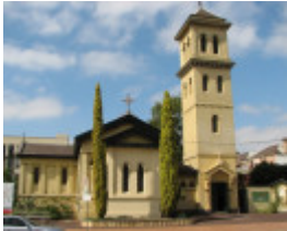
CHRIST CHURCH SOHE 2008