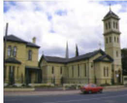
Christ Church Brunswick Front View