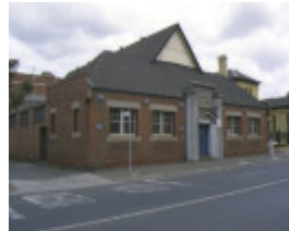
Christ Church Brunswick Rear View