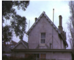
whitby house whitby street brunswick side view sep1979