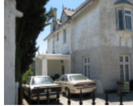
WHITBY HOUSE SOHE 2008