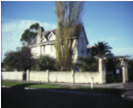
1 whitby house whitby street brunswick front view jul1979