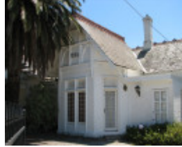
WHITBY HOUSE SOHE 2008