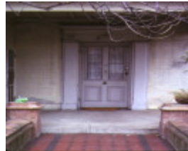
whitby house whitby street brunswick front entrance sep1979