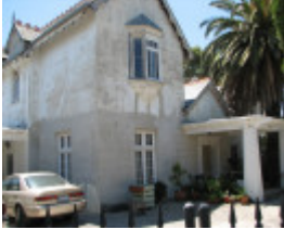
WHITBY HOUSE SOHE 2008