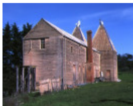
mossiface hopkilns bruthen wooden barn rear view may1983