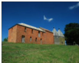
MOSSIFACE HOPKILNS SOHE 2008