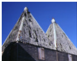
mossiface hopkilns bruthen pyramid roof may1982