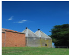
MOSSIFACE HOPKILNS SOHE 2008