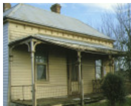
mossiface hopkilns bruthen cottage front view jul1980