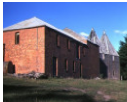
1 mossface hopkilns bruthen brick barn side view may1982