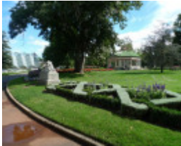
1761_Ballarat Botanic Gardens_19 March 2010