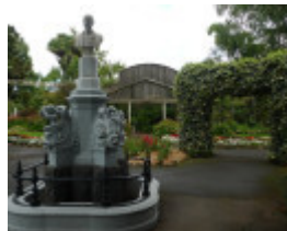
1761_Ballarat Botanic Gardens_19 March 2010