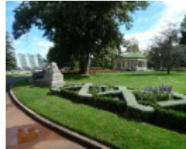
1761_Ballarat Botanic Gardens_19 March 2010