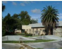
1761_Ballarat Botanic Gardens_19 March 2010