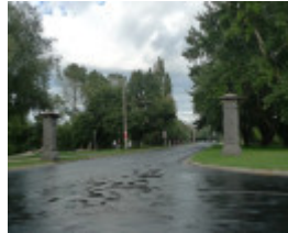
1761_Ballarat Botanic Gardens_19 March 2010