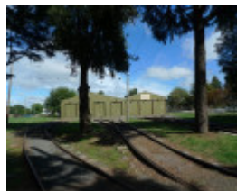
1761_Ballarat Botanic Gardens_19 March 2010