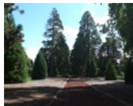
1761_Ballarat Botanic Gardens_19 March 2010