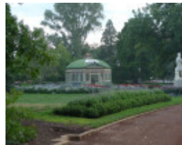
1761_Ballarat Botanic Gardens_19 March 2010