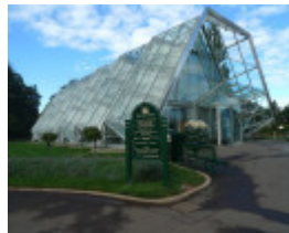
1761_Ballarat Botanic Gardens_19 March 2010