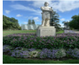
1761_Ballarat Botanic Gardens_19 March 2010