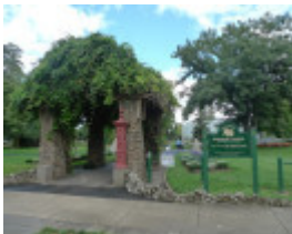
1761_Ballarat Botanic Gardens_19 March 2010