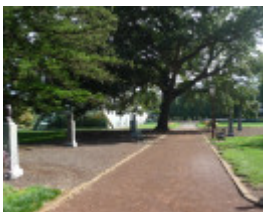
1761_Ballarat Botanic Gardens_19 March 2010