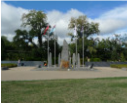
1761_Ballarat Botanic Gardens_19 March 2010