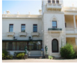
KAMESBURGH SOHE 2008