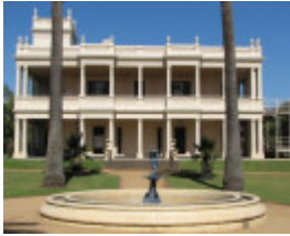
KAMESBURGH SOHE 2008