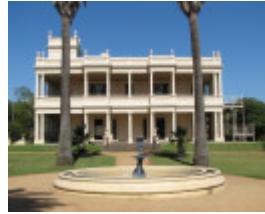
KAMESBURGH SOHE 2008