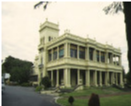
1 kamesburgh brighton front view jan1996