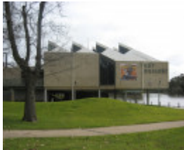
Benalla Art Gallery Aug 08_4.jpg