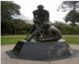
1772_Benalla_Botanic_garden: 1772_Benalla_Botanic_garden: 1772_Benalla_Botanic_garden: