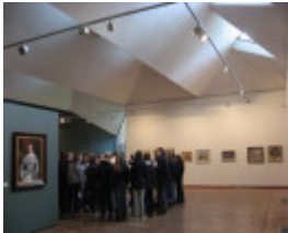
Benalla Art Gallery Interior May 2012.JPG