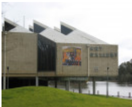
Benalla Art Gallery Aug 08_5.jpg