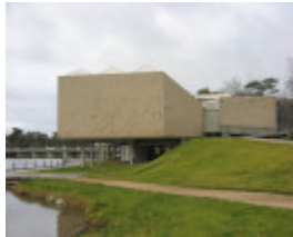
Benalla Art Gallery Aug 08_11.jpg