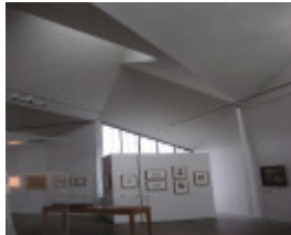
Benalla Art Gallery Interior May 2012.JPG