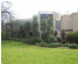
Benalla Art Gallery Aug 08_9.jpg