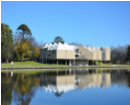
Benalla Botanical Gardens and Art Gallery