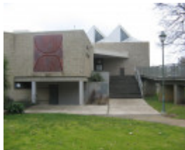
Benalla Art Gallery Aug 08_6.jpg