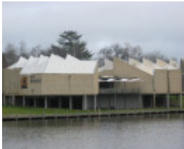
Benalla Art Gallery Aug 08_1.jpg