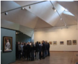
Benalla Art Gallery Interior May 2012.JPG