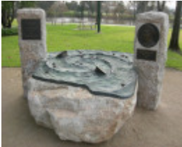
1772_Benalla_Botanic_garden: 1772_Benalla_Botanic_garden: 1772_Benalla_Botanic_garden: