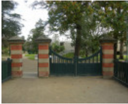
1772_Benalla_botanic_ Gardens_2010_July _2_