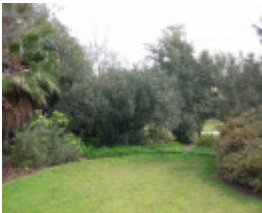
1772_Benalla_Botanic_garden: 1772_Benalla_Botanic_garden: 1772_Benalla_Botanic_garden: