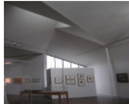
Benalla Art Gallery Interior May 2012.JPG