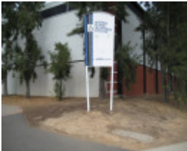
Rosalind Park - site of archaeological potential 2