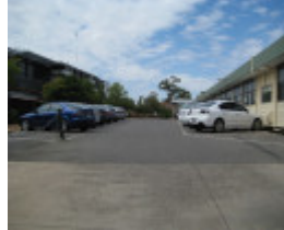
Rosalind Park, site of archaeological potential