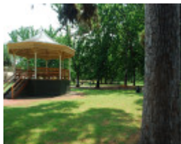
ROSALIND PARK SOHE 2008