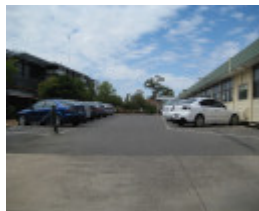
Rosalind Park, site of archaeological potential