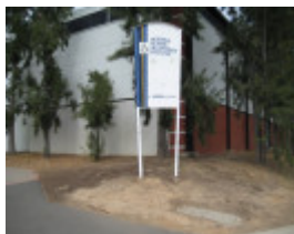
Rosalind Park - site of archaeological potential 2