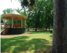
ROSALIND PARK SOHE 2008