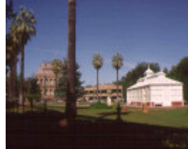
1 rosalind park bendigo dec1997 jh