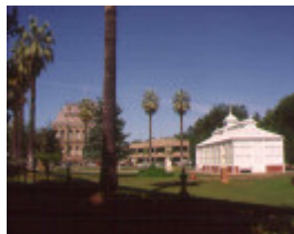
1 rosalind park bendigo dec1997 jh