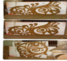
Mining Exchange_Iron works_1