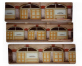
Mining Exchange_3