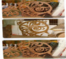
Mining Exchange_Iron works