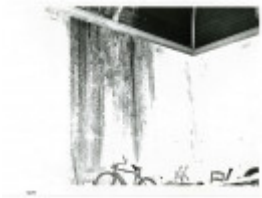
Mining Exchange_Hall_1_1976