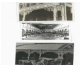
Mining Exchange_1_c1901