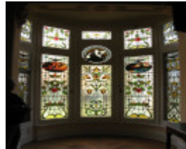
Fortuna_Bendigo_stained glass_3 August 2009