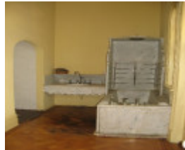
Fortuna_Bendigo_marble bathroom_3 August 2009