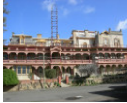
Fortuna_Bendigo_east elevation_3 August 2009