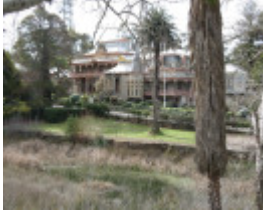
Fortuna_Bendigo_looking over lake_August 09