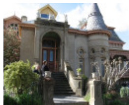
Fortuna_Bendigo_main entrance_3 August 2009