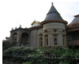
Fortuna_Bendigo_west side_3 August 2009