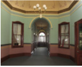
Fortuna_Bendigo_entrance hall_3 August 2009