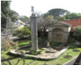
Fortuna_Bendigo_Pompeii Fountain_3 August 2009