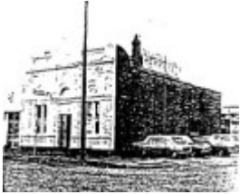
Manchester Unity Hall - film 6 / frame 14 - Ballarat Conservation Study, 1978