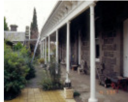
h00486 lauderdale prince street alfredton side view she project 2003