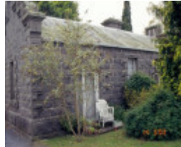
h00486 lauderdale prince street alfredton cottage she project 2003