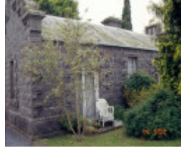
h00486 lauderdale prince street alfredton cottage she project 2003