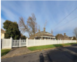
Lauderdale - July 2021