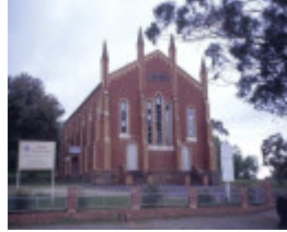
Former Wesleyan Methodist Church Elser Street California Gully Eaglehawk