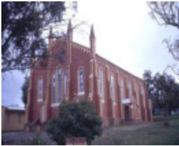
Former Wesleyan Methodist Church Elser Street California Gully Eaglehawk Right Side