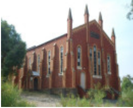
FORMER METHODIST CHURCH SOHE 2008