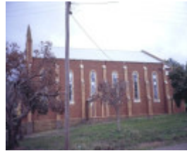
Former Wesleyan Methodist Church Elser Street California Gully Eaglehawk Side View