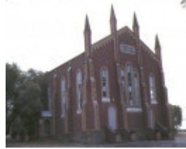
1 former methodist church california gully front view