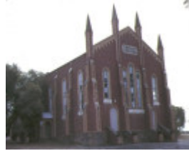
1 former methodist church california gully front view