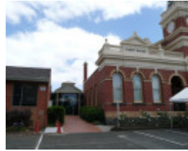
BUNINYONG TOWN HALL SOHE 2008