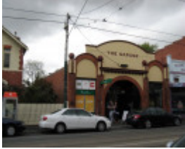
Former Hawthorn Motor Garage