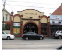
Former Hawthorn Motor Garage