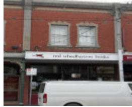
103-107 Lygon Street Brunswick East