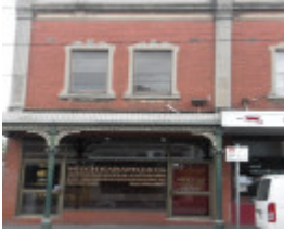
103-107 Lygon Street Brunswick East