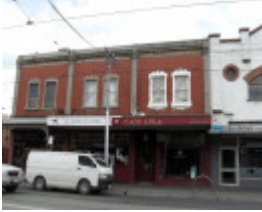
103-107 Lygon Street Brunswick East