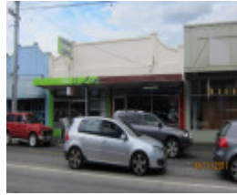
514 & 516 Lygon Street Brunswick East