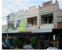
504-510 Lygon Street Brunswick East