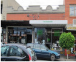
500 & 502 Lygon Street Brunswick East