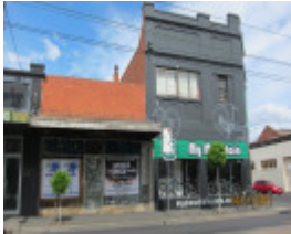
398 Lygon Street Brunswick East