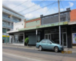
400-406 Lygon Street Brunswick East