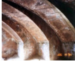
B7683 Dandenong Road Railway Bridge Underside 1