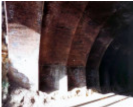
B7683 Dandenong Road Railway Bridge Underside 3