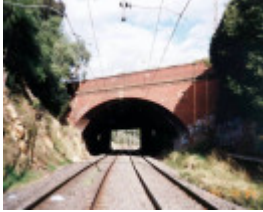
B7683 Dandenong Road Railway Bridge