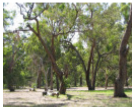
WATTLE PARK SOHE 2008