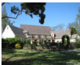
WATTLE PARK SOHE 2008