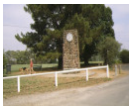
wattle park riversdale road surrey hills memorial clock and tree from lone pine