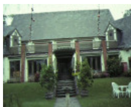
1 wattle park riversdale road surrey hills chalet