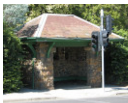
WATTLE PARK SOHE 2008