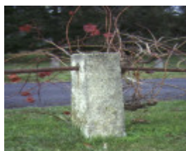
wattle park riversdale road surrey hills fence made from disused cable tram