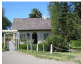
WATTLE PARK SOHE 2008