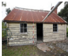
Fashoda Homestead (21).jpg