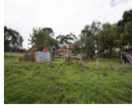
Fashoda Homestead (02).jpg