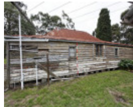
Fashoda Homestead (05).jpg