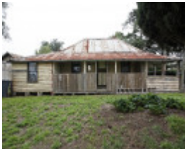
Fashoda Homestead (04).jpg