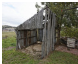
Fashoda Homestead (26).jpg