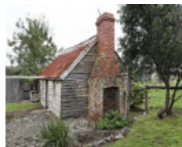
Fashoda Homestead (20).jpg