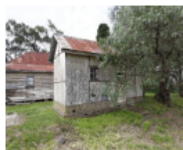
Fashoda Homestead (25).jpg