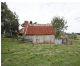
Fashoda Homestead (22).jpg