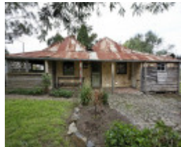
Fashoda Homestead (06).jpg