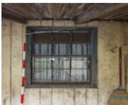
Fashoda Homestead (07).jpg