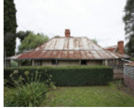
Fashoda Homestead (03).jpg