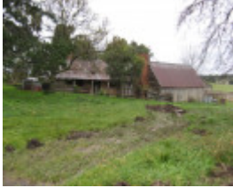
Fashoda from east